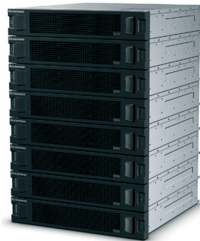
The Lenovo Storage S3200 controller unit with seven E1024 expansion units delivers a total of 192 drives.